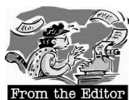
From the Editor