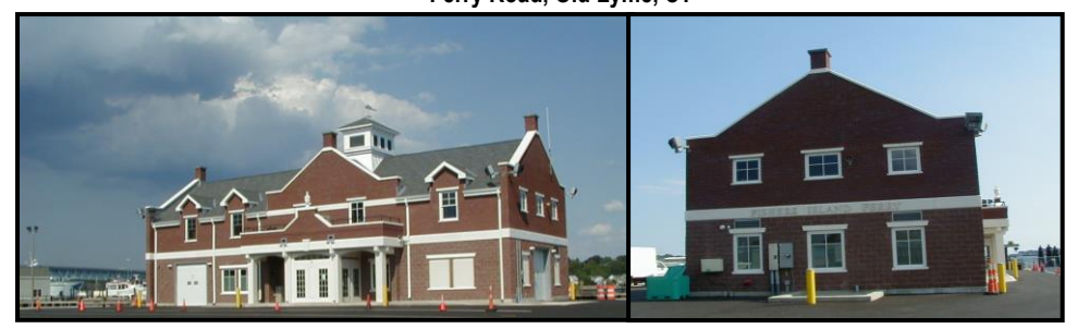
Fisher's Island Ferry District Landings, Fisher's Island, NY & New London, CT