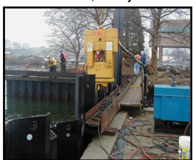
NLDC Bulkhead Replacement, New London, CT