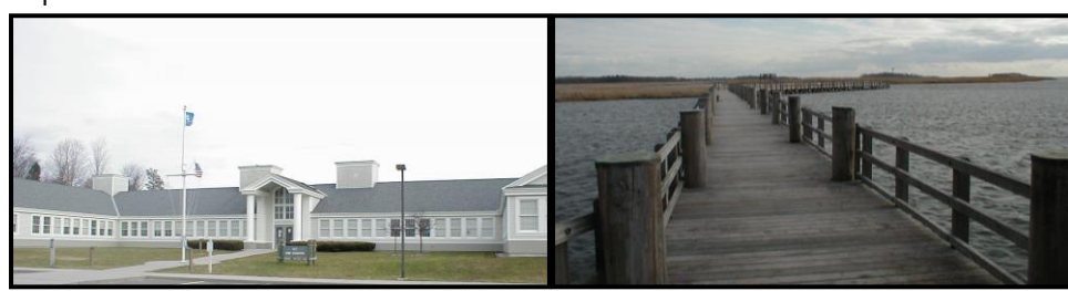
Fishing Pier, Boardwalk and DEEP Marine Fisheries Headquarters and Boating Division, Ferry Road, Old Lyme, CT

GNCB Consulting Engineers, P.C. provides structural, geotechnical engineering, and historic preservation services for waterfront projects throughout Connecticut. Waterfront projects have challenging loading requirements due to hurricane, flood or wave action exposure and also require special attention to constructability issues in their unique environments. Our experience with these projects includes new construction, condition assessment, adaptive reuse, renovation and Special Inspection.