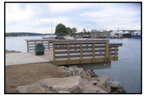
Cini Park Fishing Pier, Niantic, CT